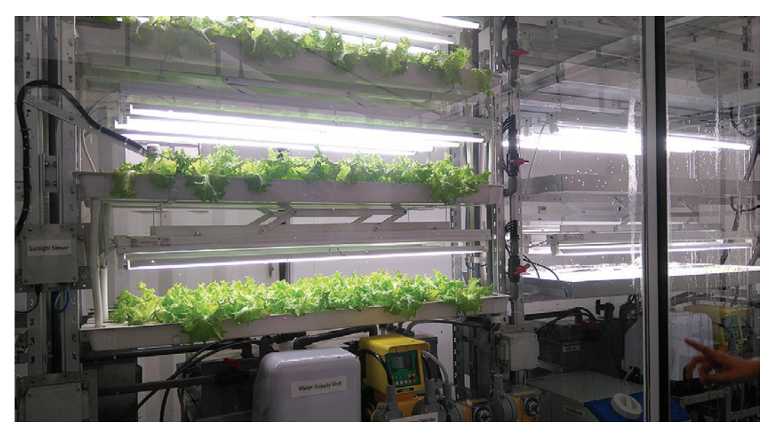
Sign in front of Fujitsu vegetable factory.