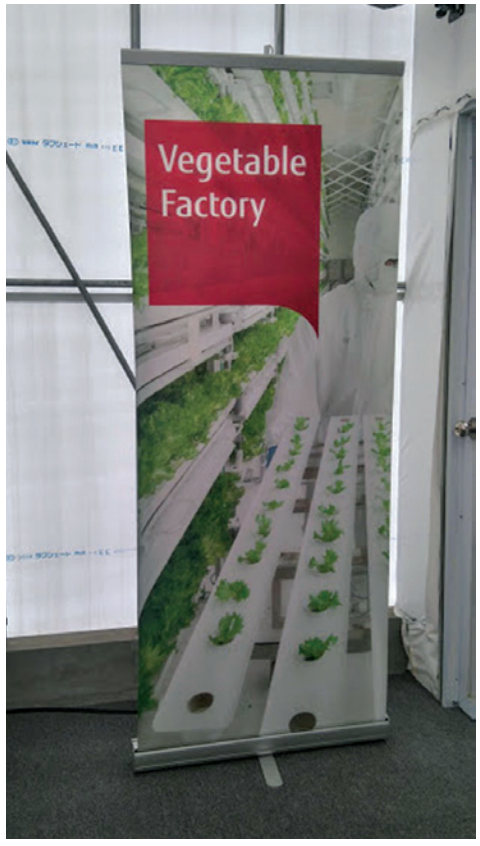
Vertical vegetable farm in Hanoi.

of Whole Foods Market for USD 13.7 billion.<sup>11</sup> The deal made Amazon the largest organic food retailer in the United States (US) overnight. Amazon's move follows its biggest competitor, the world's largest e-commerce company, China-owned Alibaba, which invested USD 1.25 billion in the Chinese online food delivery service Ele.me in late 2015, then set up its own fresh produce stores, Hema supermarket. Alibaba invested USD 12.7 billion into physical retail stores.